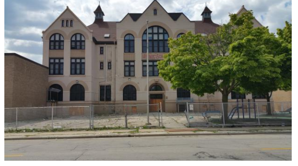
Garfield (July 2015) - Unused MPS building

But Milwaukee does not act in a vacuum. The provision of public education is a state responsibility