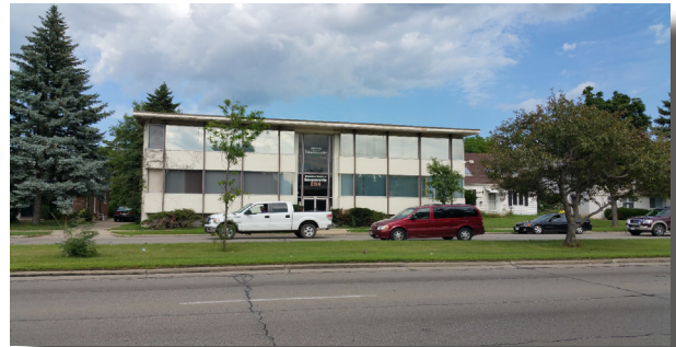
Milwaukee School of Entrepreneurship has been vacant since 2012 with several interested buyers including Career Youth Development School (2012) and Greater Holy Temple Christian Academy (2016)

Click on the map to access more information on the vacant MPS school buildings and interested private and charter schools.