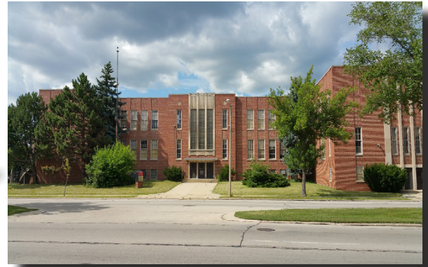
Carleton School has been vacant for 13 years with several interested buyers over the years, including Lighthouse Academies (2010) and Rocketship (2016)